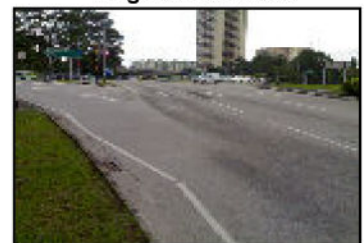
Jalan Jurong Kechil