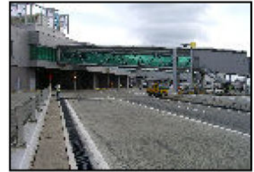
Singapore Changi Airport