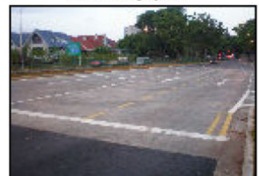
Ang Mo Kio Ave 3